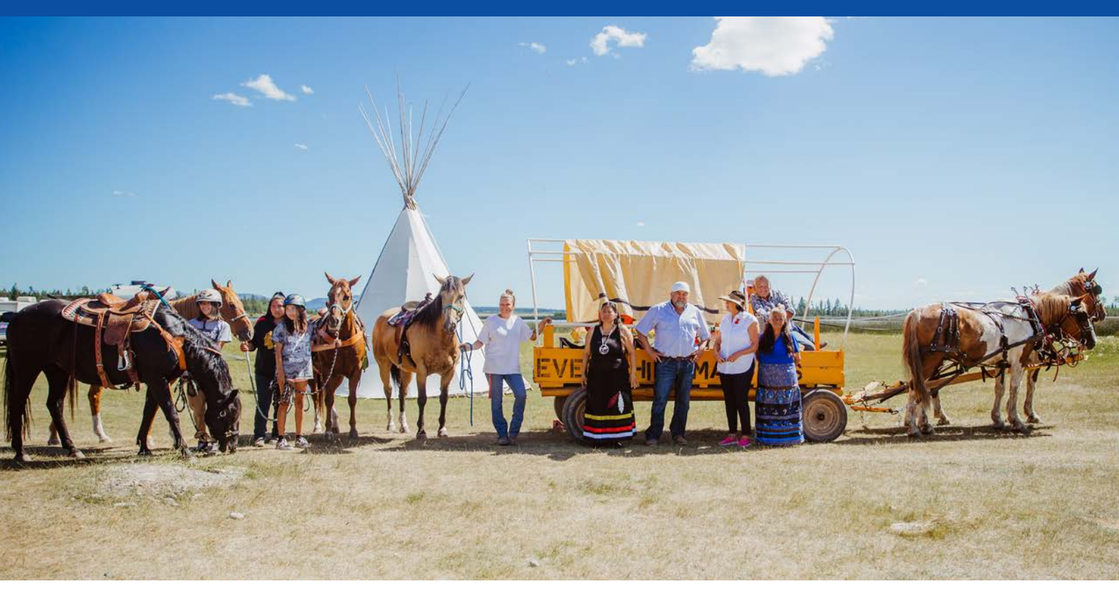
Above: Hitching a ride in a wagon at the Tsilhqot'in Culture Camp

begin our review of 2022 by recognizing the passing of Her Majesty Queen Elizabeth II, on September 8, 2022. Her Late Majesty dutifully served for seven decades, always with dignity, grace, and unwavering devotion to her people. Her passing represents the end of an era defined by its longevity, by her example of service, and by the kindness and consideration she showed to everyone. As the representative of the Crown in British Columbia, I was deeply touched by the outpouring of genuine grief expressed by so many British Columbians.