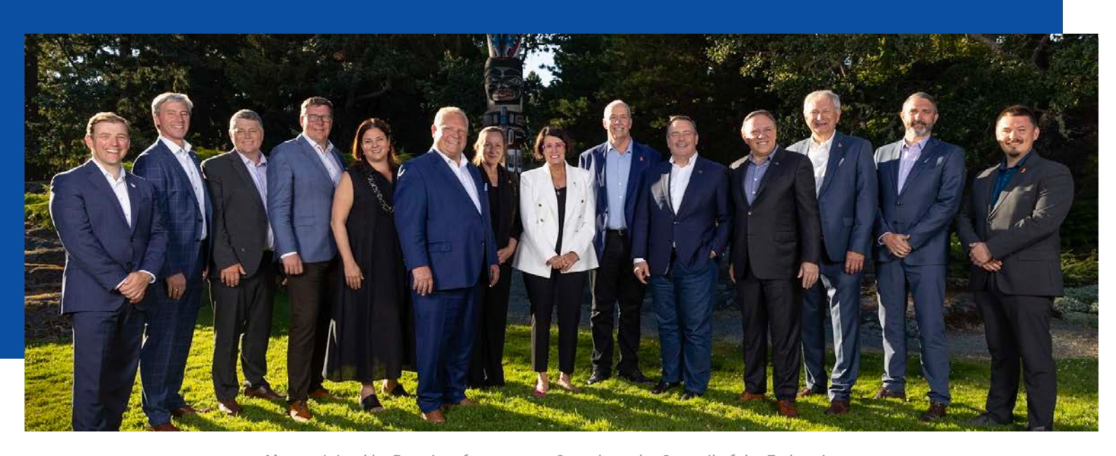
Above: Joined by Premiers from across Canada at the Council of the Federation Below: Giving remarks at the welcome reception for the Council of the Federation

I am so very grateful to all those who sustain the work of the Office of the Lieutenant Governor and who provide me with their personal support and encouragement: my Honorary Aides-de-Camp, all the volunteers with the Friends of Government House Gardens Society, the Government House Foundation, and, of course, my wonderful colleagues here at Government House.