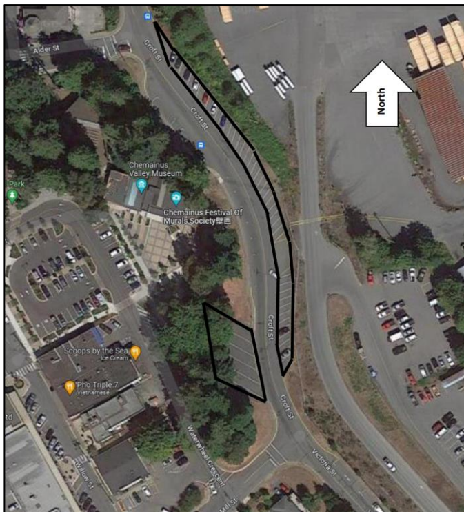
Figure 1 Location of parking violations on Croft Street.