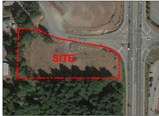
AERIAL MAP SCALE: NTS