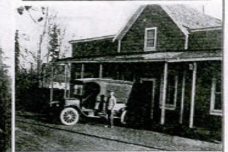
WESTHOLME STORE - BERNIE DEVITT, 1921

Westholme Tree 1500 yrs old 17' diam fell in 1913