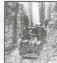
Lenora No. 1 at Mt. Sicker Mines 1901

Municipality of North Cowichan designated Westholme BC in the Official Community Plan 2002