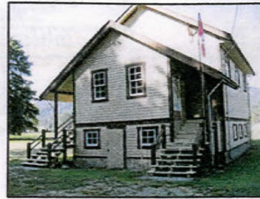
Heritage one room Schoolhouse

For individuals and groups, daytime, evenings and weekends