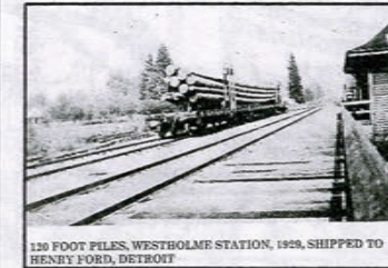
120 FOOT FILES, WESTHOLME STATION, 1929, SHIPPED TO HENRY FORD, DETROIT

Westholme Tree 1500 yrs old 17' diam fell in 1913