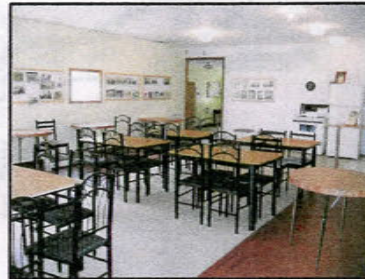
Annex includes two washrooms and full kitchen