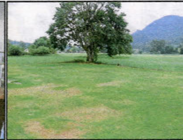
School yard is fully fenced and security alarmed