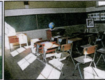
Inside 27'x 32' classroom