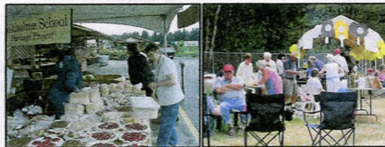
Bake Sale at Russell's Farm Market