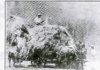
Gaisford farm on Richards Trail early 1900's