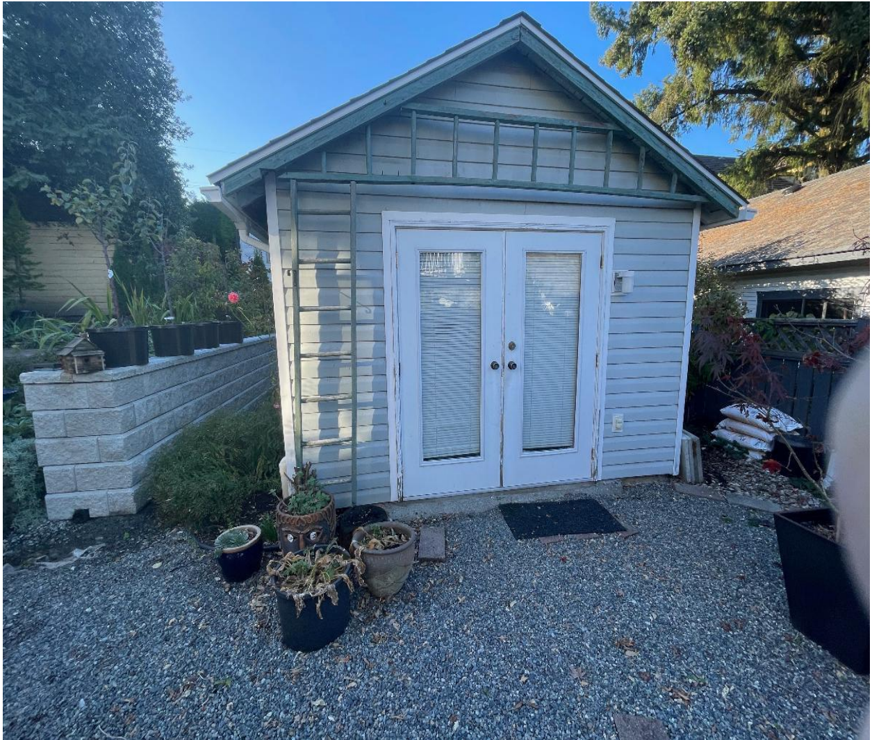
Existing accessory building