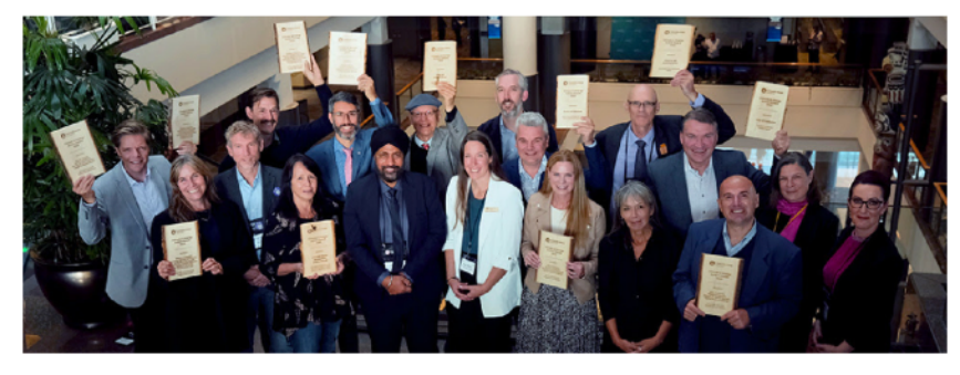
Celebrating the Leaders

The UBCM convention is an excellent opportunity for North Cowichan to demonstrate an out-sized contribution in reducing BCs carbon emissions.