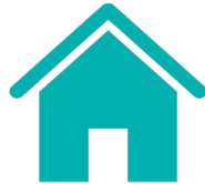
Budget and infrastructure